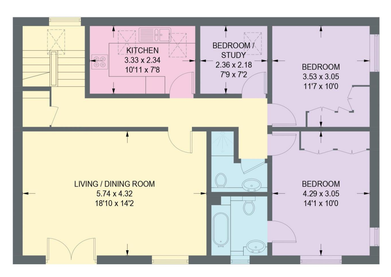
FIRST FLOOR 86.5 SQ M / 931 SQ FT

Illustration for identification purposes only, measurements are approximate, not to scale.